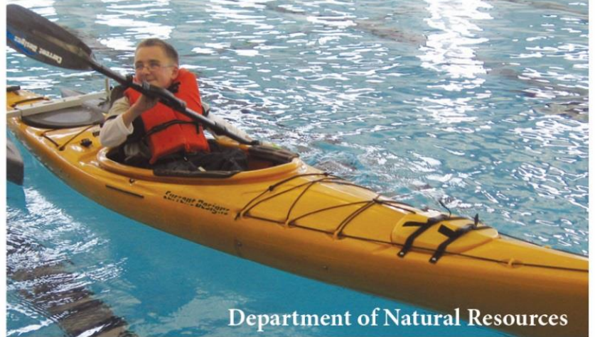
Department of Natural Resources