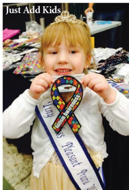
Just Add Kids