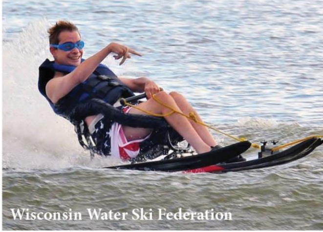
Wisconsin Water Ski Federation