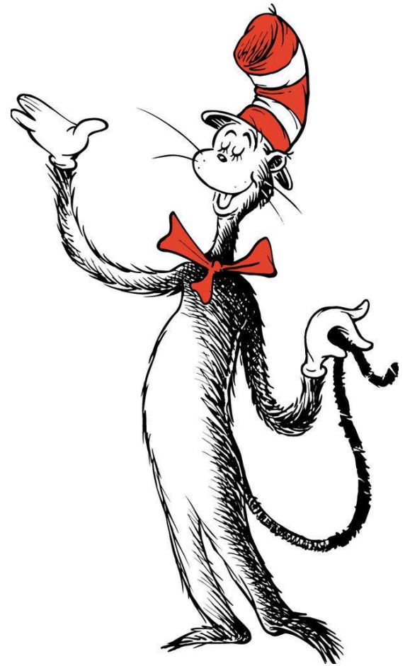
The Cat in the Hat.